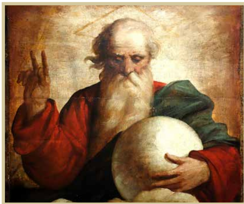
Benediction of God the Father, by Luca Cambiaso.